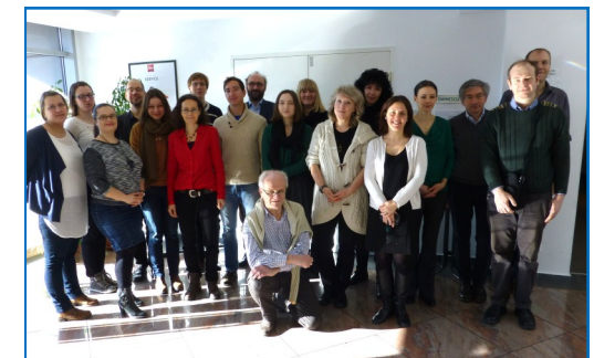
Team CEPHOS-LINK 2015

CEPHOS-LINK will also benefit from the expertise of service users through collaboration with non-governmental organisations and input from focus groups.